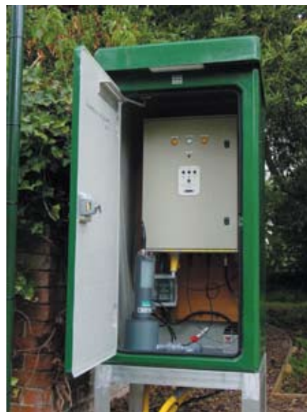
A "green box" automatic water quality monitoring station quickly provides localized data at many points throughout the Thames River