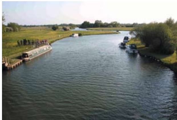
The Thames is the longest river in England and the most closely monitored for pollution.

CSO is the discharge, during rain storms, of untreated wastewater from a sewer system that carries both sewage and storm water (a combined sewerage system). The increased flow caused by the storm water runoff exceeds the sewerage system's capacity and the sewage is forced to overflow into streams and rivers in the area through CSO outfalls.